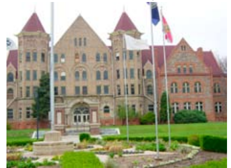
Treat Hall Today

The landscape design process involved close collaboration with members of the design team, particularly the architect, in order to seamlessly tie new addition to the building into the landscape. Other work included presentations to the client, participation in a preliminary LEED (Leadership in Energy and Environmental Design) analysis, and iterative presentations to the Denver Landmarks Preservation Commission.