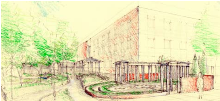
Labyrinth and Crescent Trellis

The graphic products depict a compelling vision for the gardens, and through a carefully crafted phasing scheme, will allow the gardens to be developed as funding becomes available.