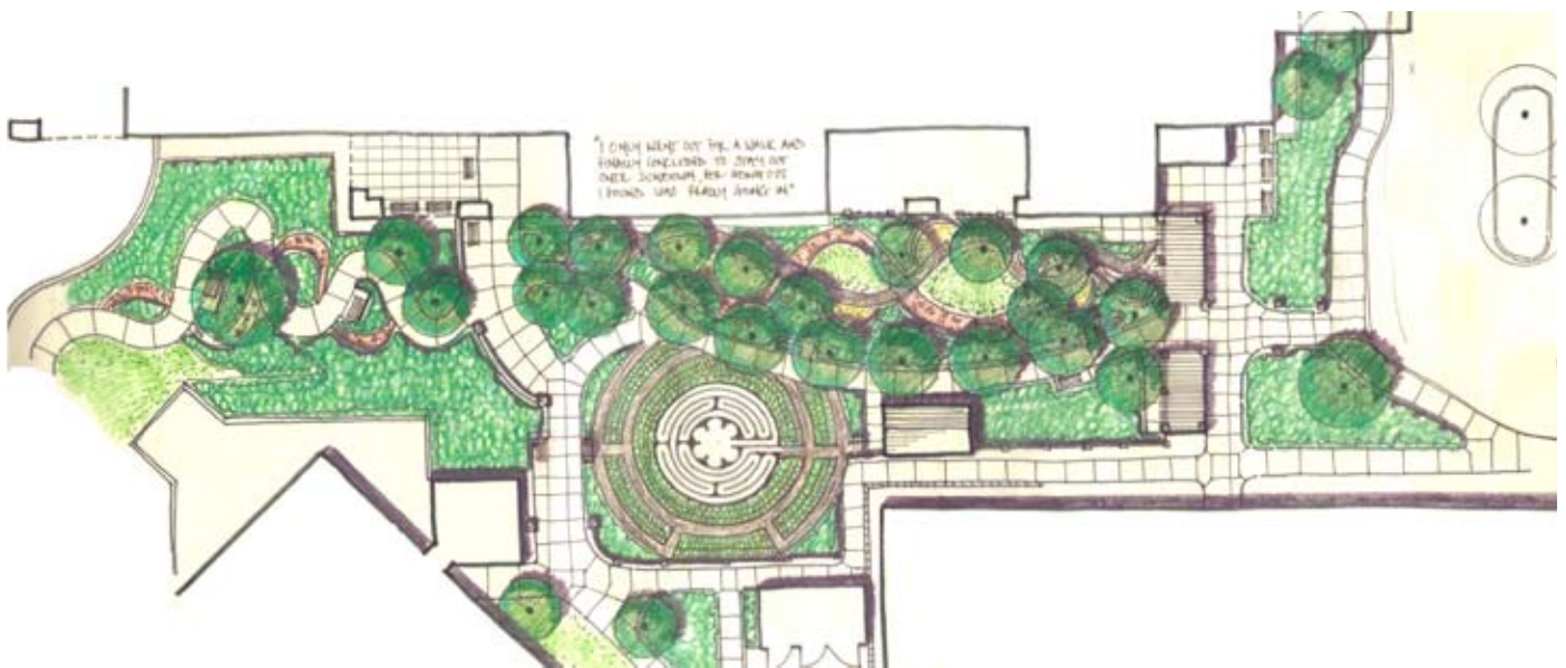
Plan of Healing Garden