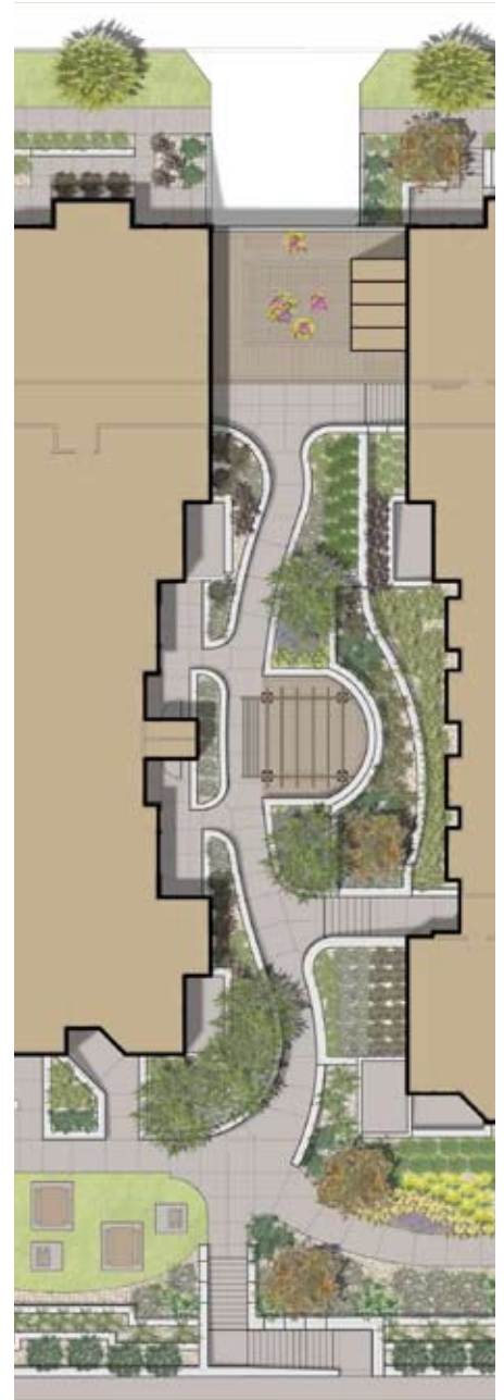
Enlargement of Center Courtyard

T his exciting new high density, mixed-use project, at the edge of the University of Colorado's Boulder Campus, is the first phase of a three-phase development. The project consists of four 4-story condominium buildings with retail space at the west end.